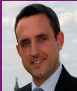
Alex Cole- Hamilton, Scottish Liberal Democrat Party