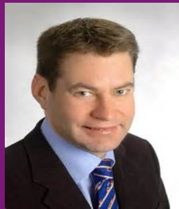
Murdo Fraser MSP, Scottish Conservative and Unionist Party