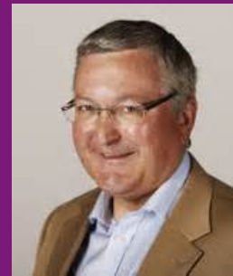
Fergus Ewing MSP, Scottish National Party