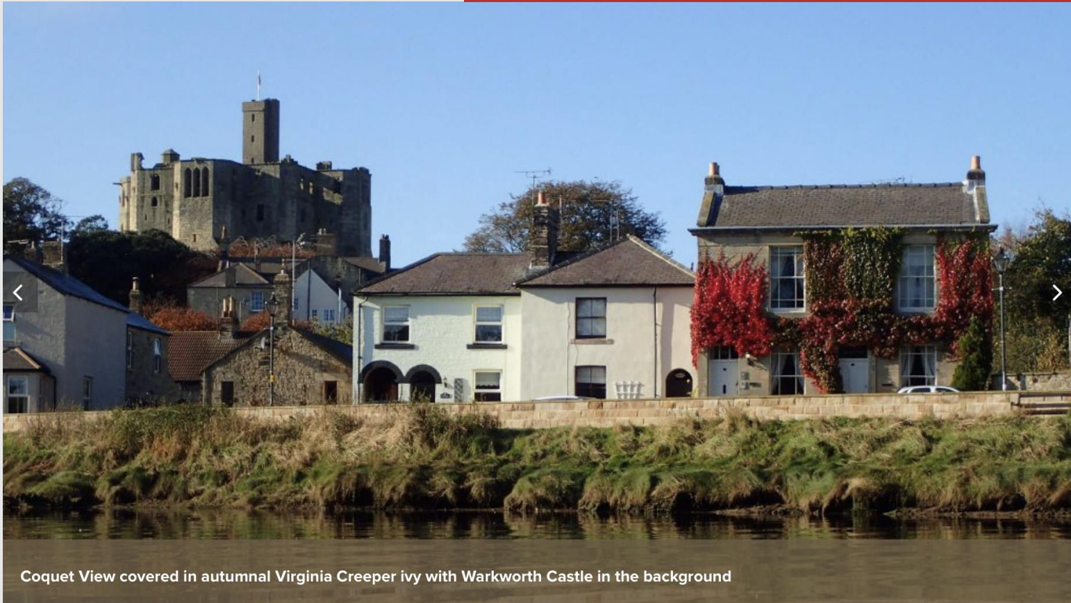
Coquet View covered in autumnal Virginia Creeper ivy with Warkworth Castle in the background